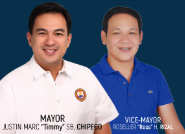
MAYOR JUSTIN MARC "Timmy" S.B. CHIPECO

3rd + OFFENSE: 5 araw - 6 na buwang pagkabilango o multang Php 600 hanggang Php 1,000 o parehong kaparusahan ayon sa pagpapasiya ng hukuman